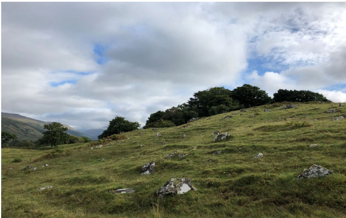
Plate 5.5: Looking east to tower 41.