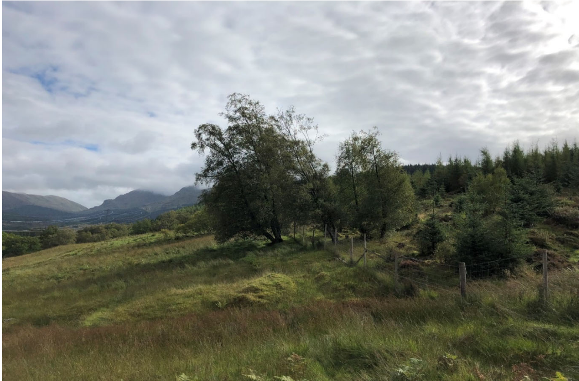
Plate 5.8 – Looking east to tower 46.