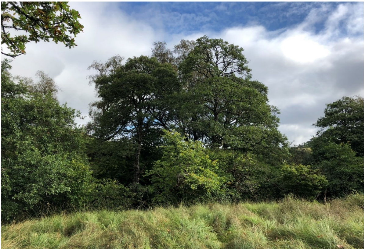
Plate 5.2: Looking east to tower 40