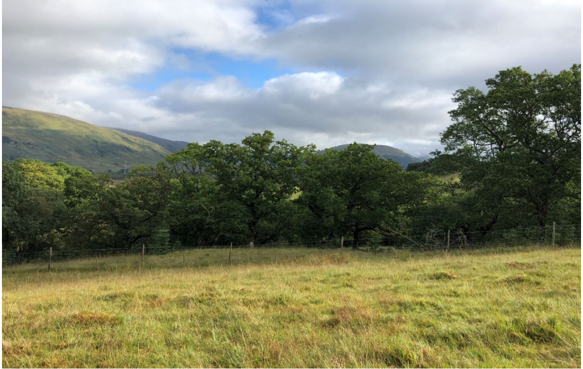
Plate 5.1: Looking east to tower 40.