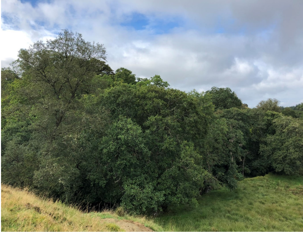
Plate 5.3: Looking west to tower 39

5.1.5 Plates 5.1 to 5.3 shows an area of native broadleaved woodland located between Tower 39 and 40, within the riparian zone of the Allt Mhaluidh burn. The broadleaved woodland is mature and host to a range of tree species including Oak, Birch, Hazel, creating a diverse woodland habitat characteristic of National Vegetation Classification (NVC) Woodland Type – W11 “Upland oak-birch woodland”. Several small Sitka spruce trees have become established through natural regeneration.