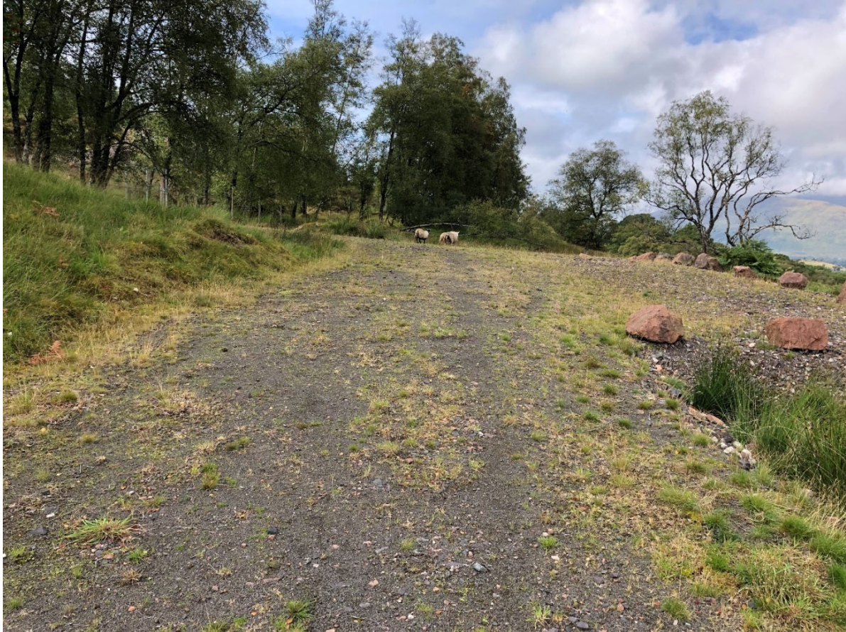
Plate 5.9: – Looking south west the access track section on Brackley Farm between towers 46 and 47.