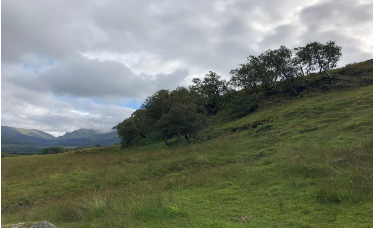
Plate 5.6 - Looking East to tower 43.