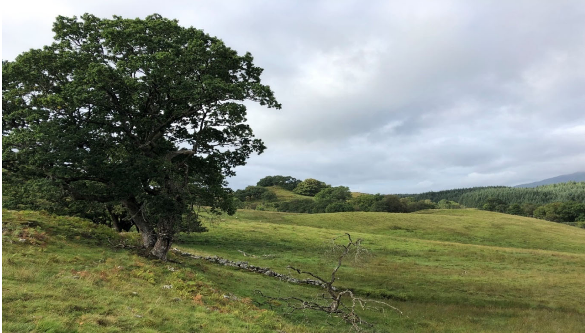
Plate 5.4: Looking west to tower 40. Showing the open moorland pasture and area of native broadleaved woodland.